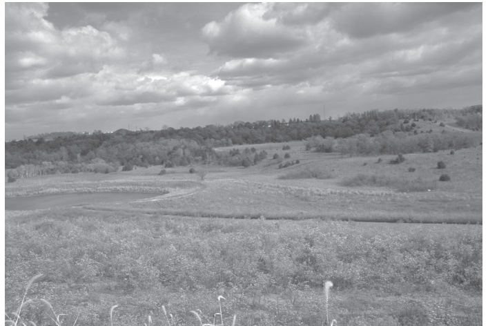
The “Sand Coulee” is one of those rare remaining natural places in Dakota County. A variety of native species and some rare plants reside there, and the landowners are working together to protect and restore this important site.

In addition to the funds generated by the referendum, the county hopes to leverage considerable state, federal and private sources to further extend the program’s reach.