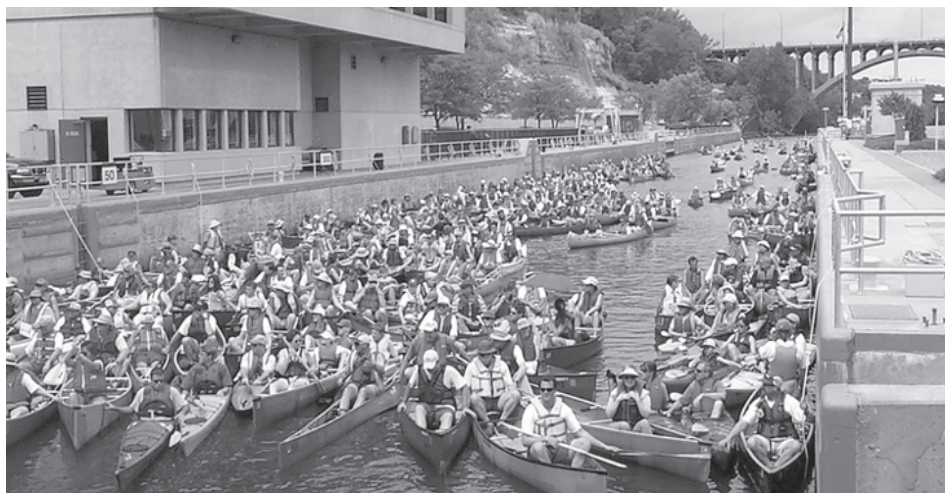
Lock #1 at the 5th Annual Canoe Adventure