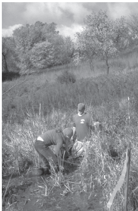
Macalester students and other volunteers planted native species in an emergent marsh wetland at the Katharine Ordway Natural History Study Area in Inver Grove Heights.

Friends of the Mississippi River partnered with Great River Greening and Macalester College to coordinate this event. Thank you to all the dedicated volunteers and partners who made this project a success!