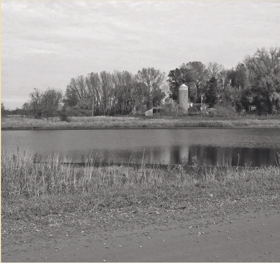
The proposed trail corridor includes opportunities to protect and restore adjacent natural areas that would give trail users a chance to experience and learn about water quality and wildlife habitat.