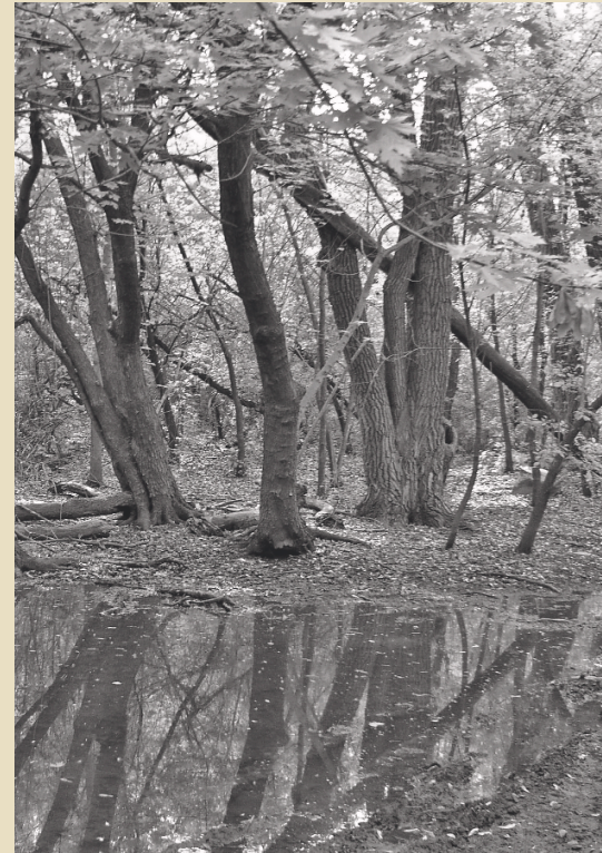
The floodplain forest at the Heritage Village Park site is one of the remaining natural area remnants that will be restored as part of the plan for the city park

The city of Inver Grove Heights has developed a plan to clean up the contamination and turn the park into a welcoming natural area offering recreational opportunities, a performance space, restored natural areas and interpretive components. Working with the city and the Minnesota Environmental Initiative, in collaboration with Emmons and Olivier Resources (EOR), FMR's restoration ecologist, Karen Schik, recently completed a management plan for the restoration. EOR completed a vegetation survey and recommended phytoremediation, a process using plants to draw contaminants out of the soil. Debris will soon be cleared from the site so the restoration and remediation work can begin. A clean and healthy park will begin to take shape as we work to restore natural areas and create a space with access to the river and respect for its character.