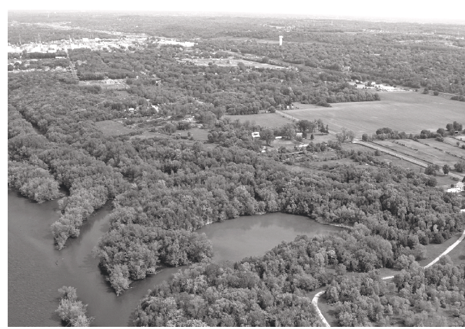
Aerial view of the proposed River's Edge site showing a small backwater bay in the lower center.