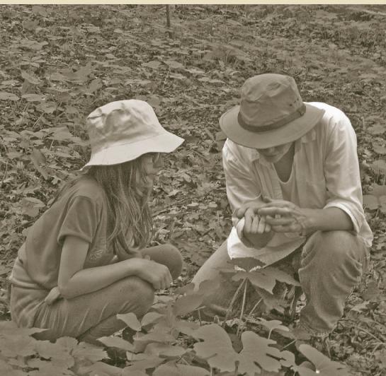
Gorge volunteers collect woodland seeds that will be redistributed at the site.

The unique geography of the Mississippi gorge where it meets 36th Street in Minneapolis includes remnant mesic prairie, oak forest and oak savanna. Since 1998, many volunteers and numerous partner organizations have been working to restore the savanna and increase the diversity of native plants in the area.